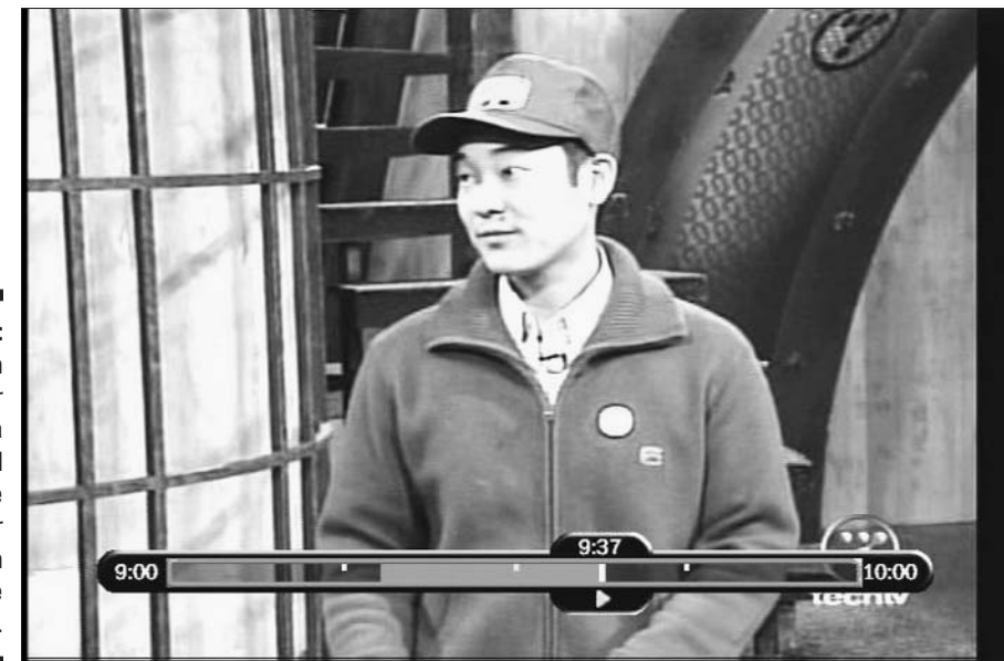
Figure 5-3: The green Status Bar places a visual perspective on your location within a live TV show.

Note the light portion of the bar, directly beneath the numbers 11:14. That light-shaded block (it's green, when seen onscreen) represents how much of the live show TiVo has recorded. (The light block keeps growing longer as you watch.) The block's right end represents the place where you catch up with live TV. Its left end, by contrast, shows where TiVo began recording.